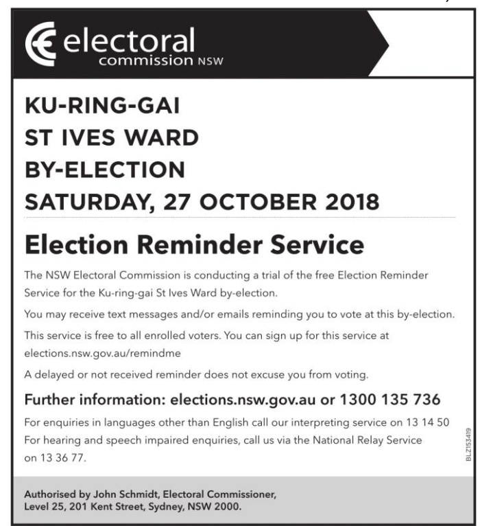
Figure 1: Advertisement for the Election Reminder Service: North Shore Times, 18 October 2018