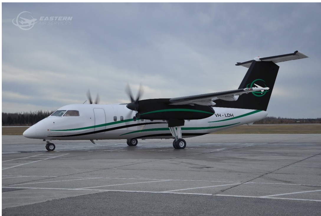
Artist Impression of EAL DASH 8