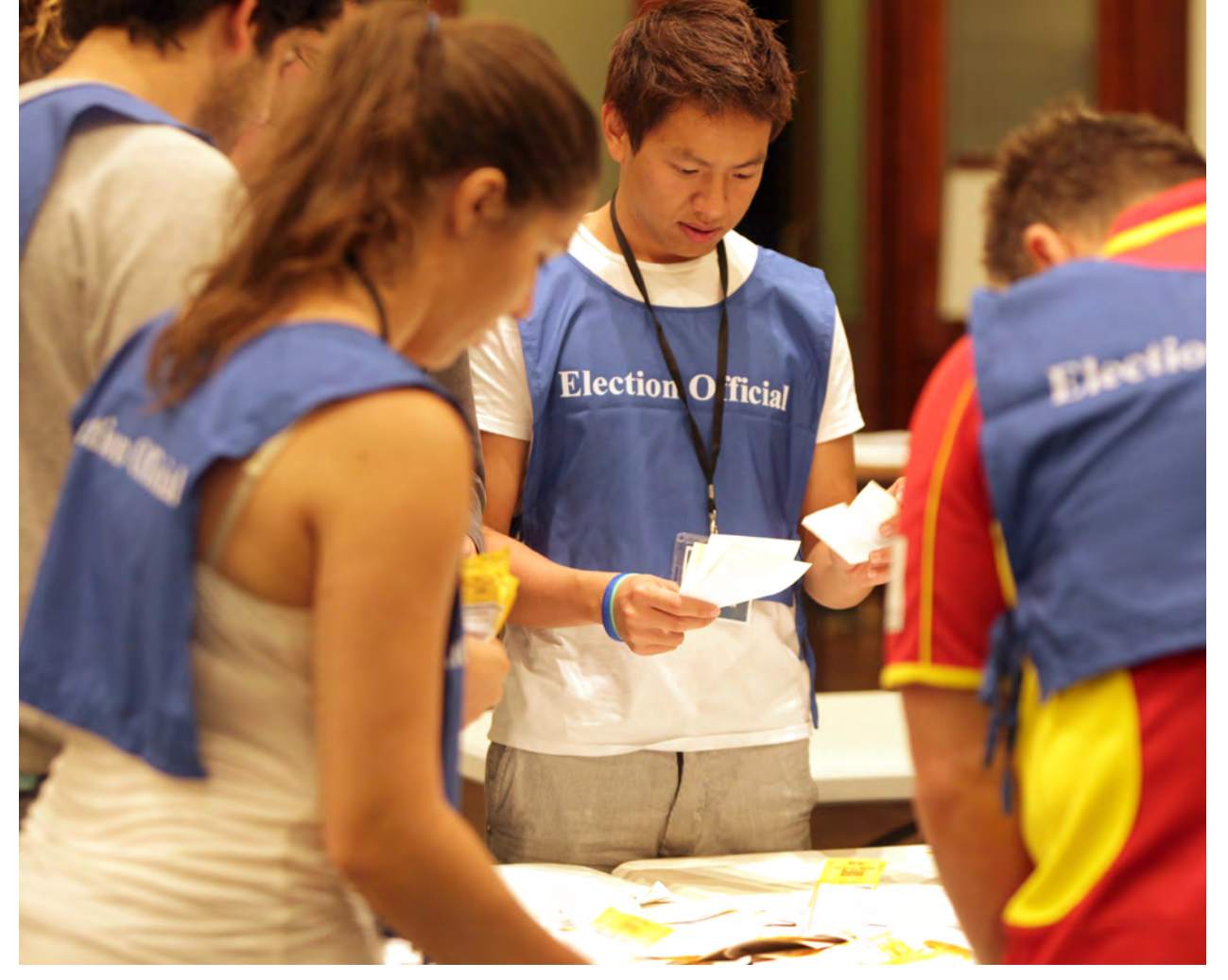
2011 State Election - after polling sorting of ballot papers