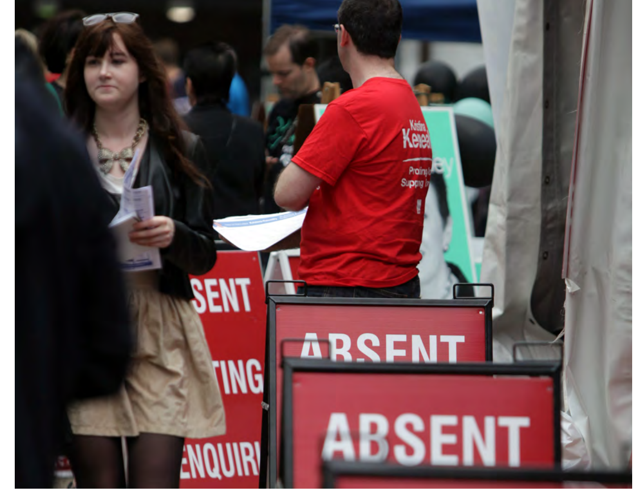
2011 State Election - offering 'How to Vote' information