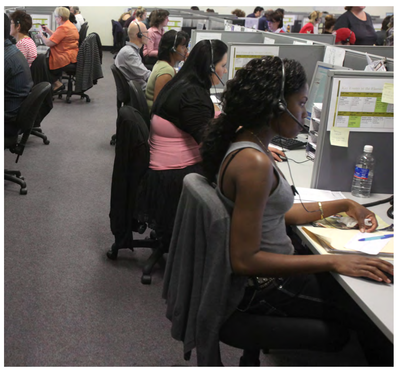
2011 State Election - NSWEC Elector Enquiry Centre