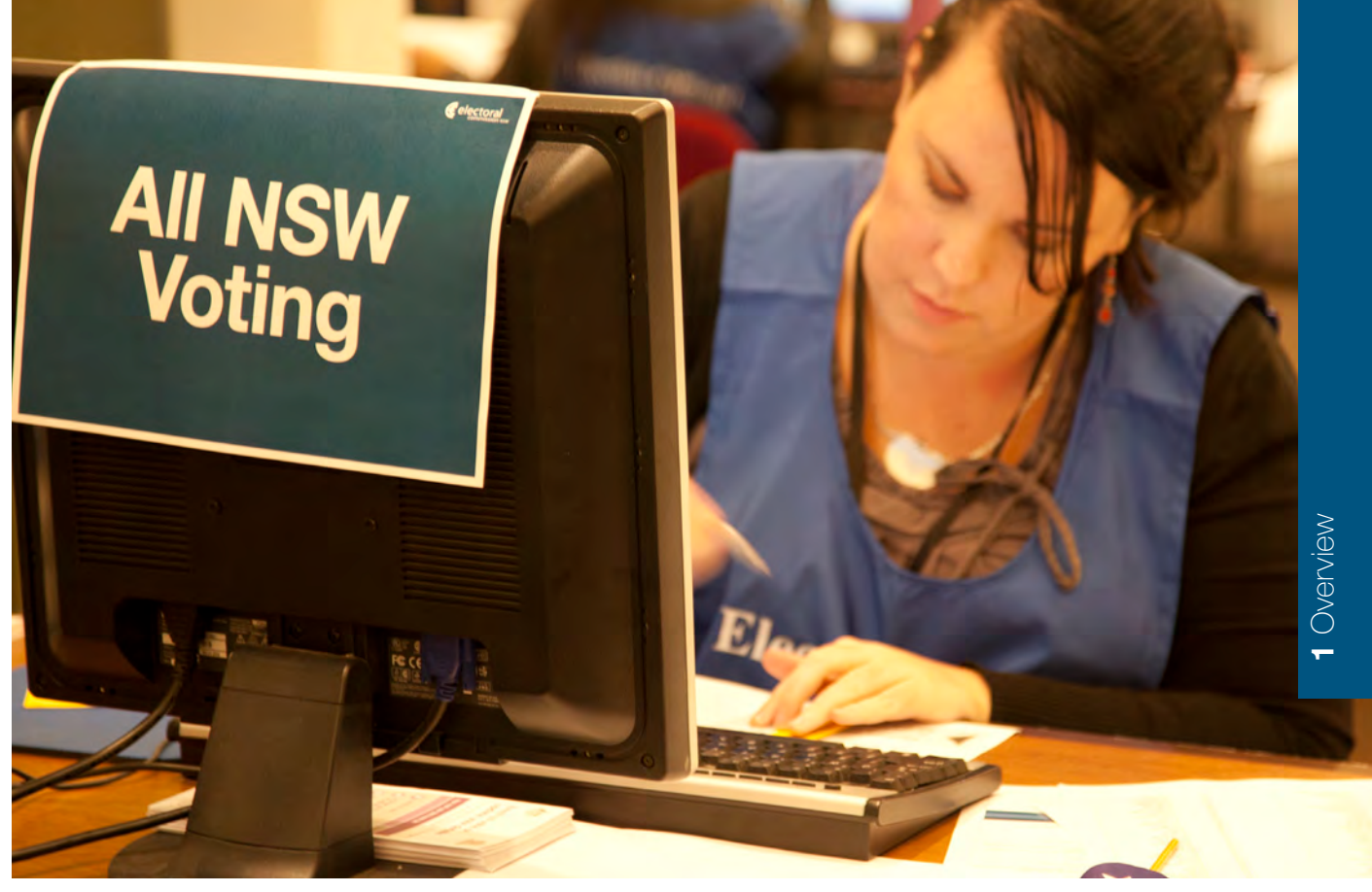
2011 State Election - Sydney Town Hall absent vote processing