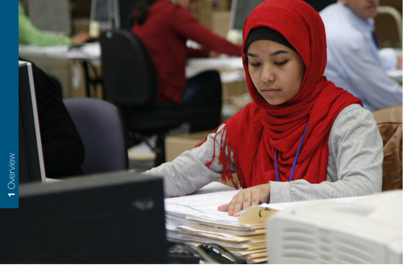
2011 State Election - check count at the NSWEC count centre