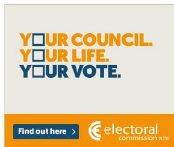
Frame 4 - The banner pauses on the final frame