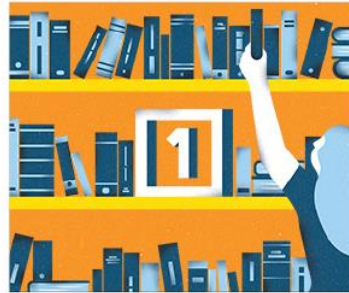
Frame 2 - The banner pans to reveal the #1