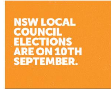
Frame 3 - The white copy appears on the orange background