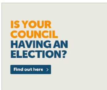
Frame 3 - the orange coloured text appears, followed by the blue text and button