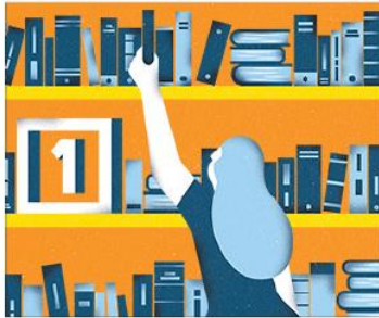
Frame 1 - The banner opens on an image of a woman reaching for a book in a library